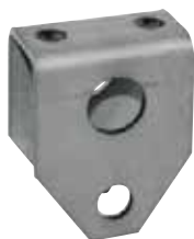
Plate to suit Taarup - Kverneland Mowers